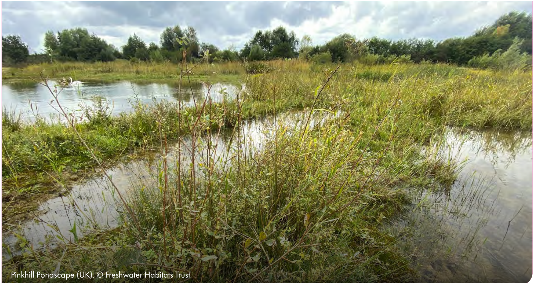
Pinkhill Pondscape (UK).

The PONDERFUL Sustainable Finance Inventory in the PONDERFUL technical handbook identifies 24 different "financing instruments" that pondscape managers can use to pay for ponds, including: revenue-generating measures for government or private landowners, public subsidies and grants, private donations, borrowing, investing, and contractual approaches.