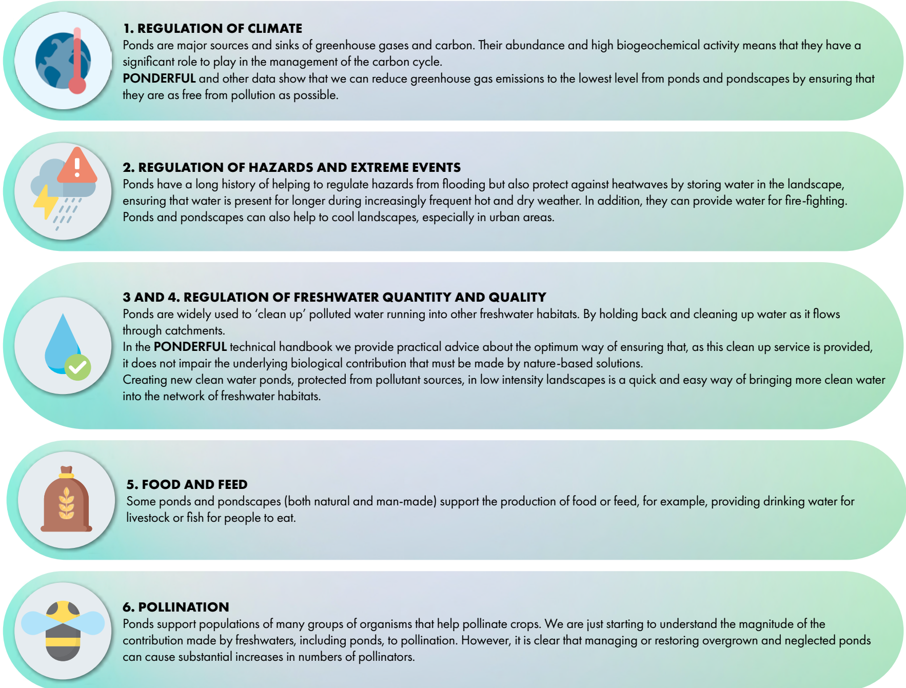
Table 1. How ponds can provide nature-based solutions to address societal challenges