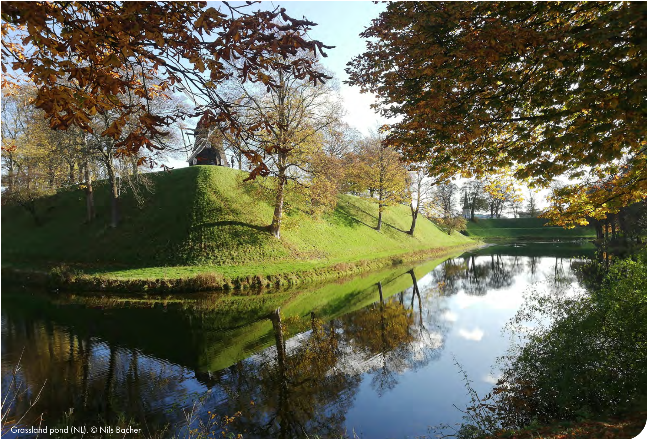
Grassland pond (NL).