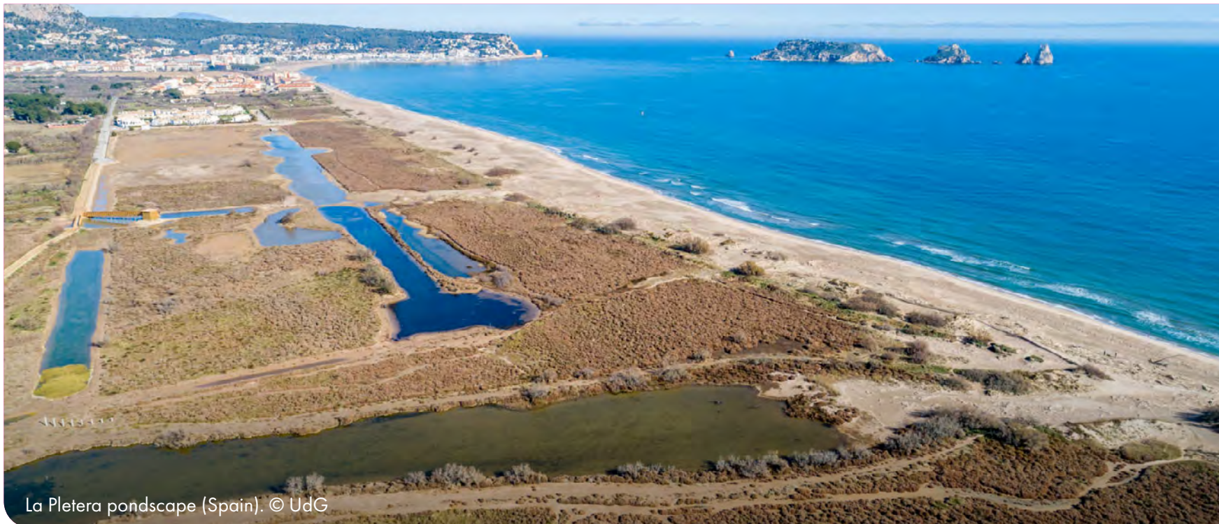
La Pletera pondscape (Spain).

The proposal for a 'Convention on the protection of ponds' provides some valuable suggestions for policy makers concerned with management of land and water.