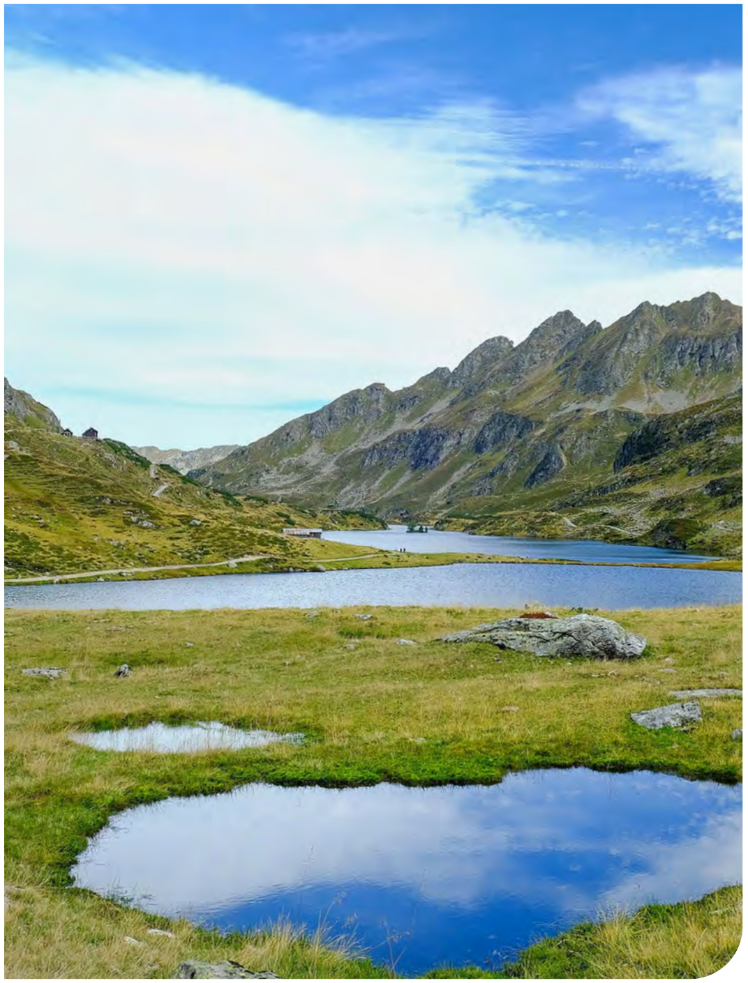
Alpine pond. 🖲 Shogun